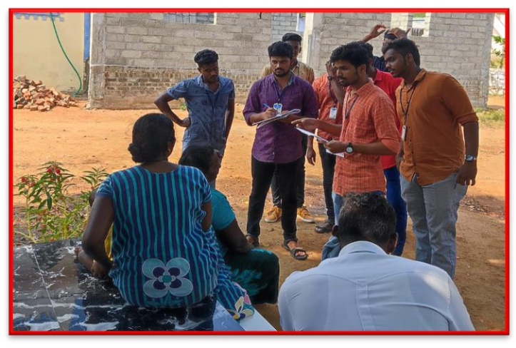
Village: Alangulam Collecting information