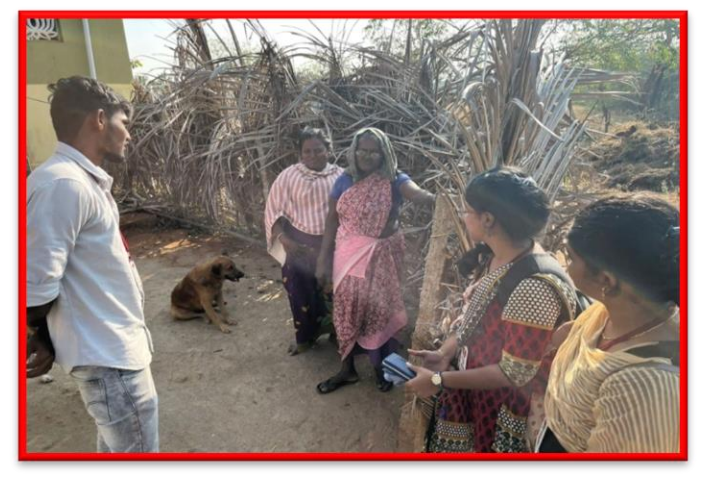
Village: Singnagar Students Interacting with people