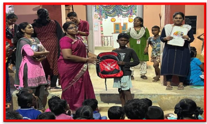
Village: Kattapuli Moments of reward