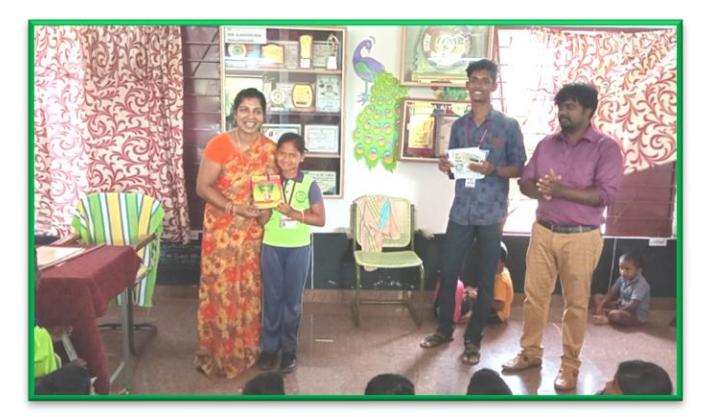
Village: Mallakulam Expressing closeness with family