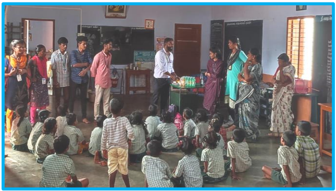
Village: Aayakulam Interaction with School Students