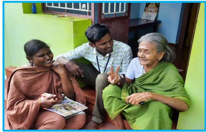
Village: West Rengasamuthiram Students Interacting with people