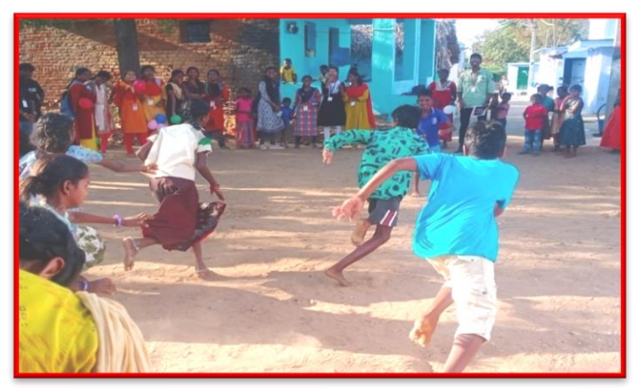
Village: Kuthalaperi Running to win